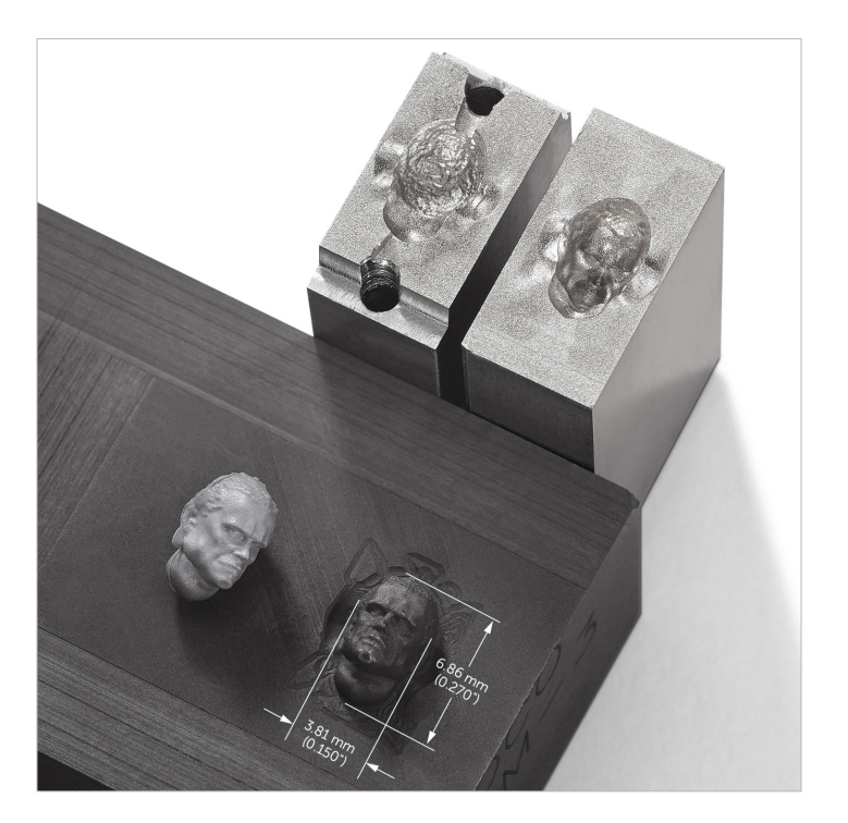
Figure 1. Electrode, cavity, and molded part with lifelike facial features

This project was to manufacture an injection mold for a miniature segmented military figure that could be pieced together with different details and create a diverse collection. This mold was to have interchangeable insets to allow an assortment of components to be molded. These inserts were comprised of various details such as head, upper torso, and lower body sections as well as military accessories. The extreme detail requirement of these components produced the need to create a machining and EDM program that would replicate unique lifelike features (Figure 1) such as forearm muscles, hair texture, miniature communication equipment, and weapon features. Prior to the beginning of each job, the JB Precision production team meets to discuss the most feasible means of undertaking the project. This venture was no different and was treated with the same considerations as any other project at JB Precision