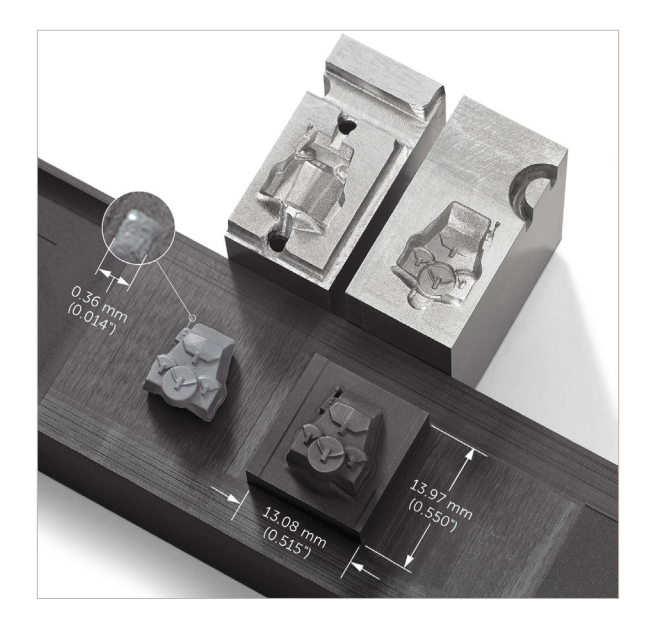
Figure 2. Electrode and insert showing antenna with 0.010" wire and 0.014" tip

The electrodes were machined on a HAAS "mini-mill" at a speed of 6,000 RPM with cutters ranging from 0.015" down to 0.008". These extremely small cutters allowed machining the intricate detail with exceptional accuracy on the more delicate features such as a 0.010" antenna wire projecting from a backpack (Figure 2). To meet the tolerance requirements, the electrodes were machined with a 0.001" per side undersize on some details. One specific detail was the brim of a hat measuring 0.011" thick × 0.070" in length after molding. The time to machine each electrode ranged from 30 minutes for the head detail to 1 hour and 15 minutes for the lower body detail.