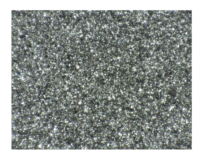
Figure 5. Surface finish in the cavity – graphite on left, copper on right.