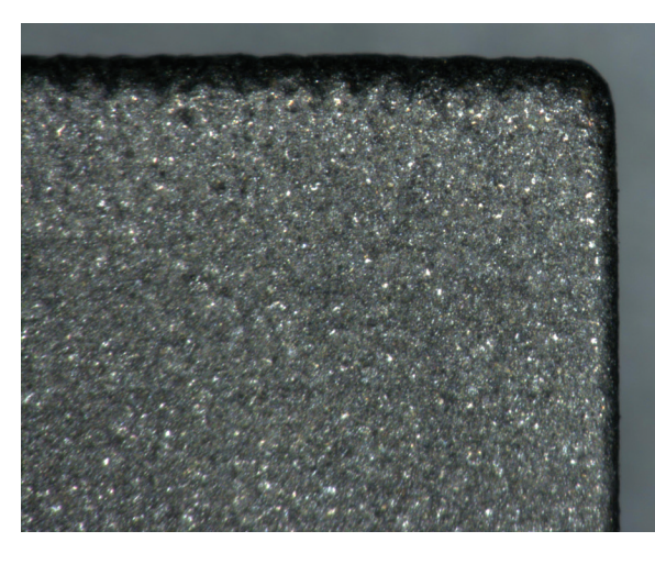
Figure 3. Roughing electrodes – graphite on left, copper on right.